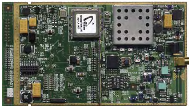
Figure 1-1. AW400TxEXT

AW400TxEXT DSP based integrated UHF Modem is the single board OEM wireless transceiver intended for SCADA, outdoor telemetry applications and transmission / receiving of differential corrections and additional information by terrestrial radio channels between two GNSS receivers. AW400TxEXT is a half duplex, UHF Radio Transceiver. It takes incoming data, modulates it with GMSK, FSK, PSK or most spectrum efficient QAM modulation and transmits it at RF power output levels from 15 dBm up to 30 dBm operating in UHF frequency band (360 to 470 MHz).