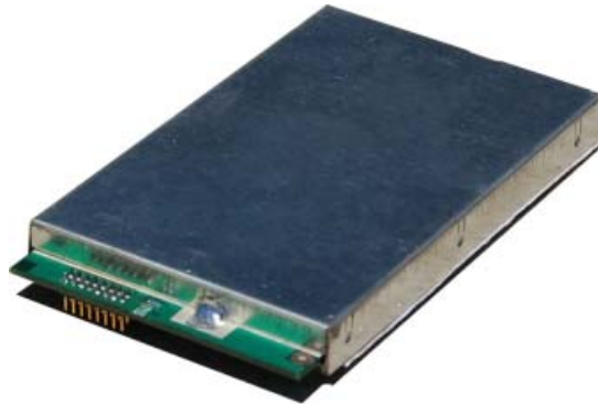
Figure 1-1. AW400Rx

AW400Rx DSP based integrated UHF receiver is the single board OEM wireless receiver intended for SCADA, outdoor telemetry applications and receiving of differential corrections and additional information by terrestrial radio channels between two GNSS receivers.