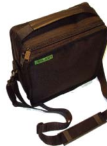
Bag for Modem p/n 30-597110-01 (optional)