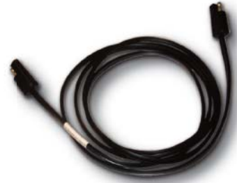
Extension Cable SAE/SAE (6ft/1.8m) p/n 14-578102-01