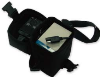
Battery Kit 1 p/n 99-587300-10 (optional)