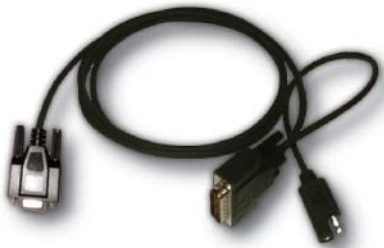
Accessory Data-Ser-Pwr Cable, DB9/DB15/SAE p/n 14-578110-02

The support area of the website www.arwestcom.com provides access to frequently asked questions, configuration procedures, manuals, e-mail support, etc. Should you have any problems with AW200, please contact ArWest Customer Support support@arwestcom.com . Generally, you will receive a response within 24 hours or less, depending on the severity of the problem.