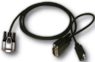
Accessory Data-Ser-Pwr Cable, DB9/DB15/SAE p/n 14-578110-02

The support area of the website www.arwestcom.com provides access to frequently asked questions, configuration procedures, manuals, e-mail support, etc. Should you have any problems with AW100, please contact ArWest Customer Support support@arwestcom.com . Generally, you will receive a response within 24 hours or less, depending on the severity of the problem.