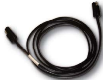
Extension Cable SAE/SAE (6ft/1.8m) p/n 14-578102-01