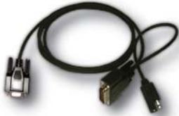
Accessory Data-Ser-Pwr Cable, DB9/DB15/SAE p/n 14-578110-02

The support area of the website www.arwestcom.com provides access to frequently asked questions, configuration procedures, manuals, e-mail support, etc. Should you have any problems with AW100BT, please contact ArWest Customer Support support@arwestcom.com . Generally, you will receive a response within 24 hours or less, depending on the severity of the problem.