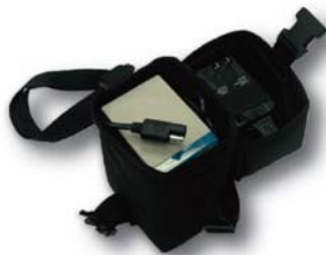
Battery Kit #1 p/n 99-587300-10 (optional)