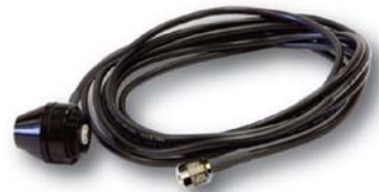
Accessory UHF Ant Cable TNC/Pole Mount p/n 14-578117-02 (optional)