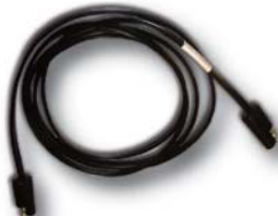
Extension Cable SAE/SAE p/n 14-578102-01