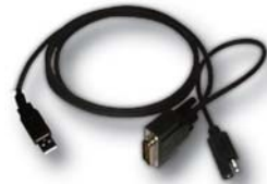
Access Data-Ser-Pwr Cable, USB/DB15/SAE p/n 14-578123-02