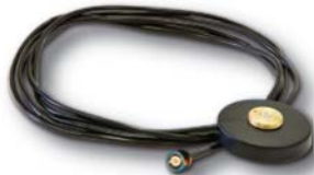
Accessory UHF Ant Cable TNC/Magn Moun p/n 14-578115-02 (optional)